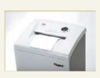
Permanent measurement of paper volume for uninterrupted shredding.