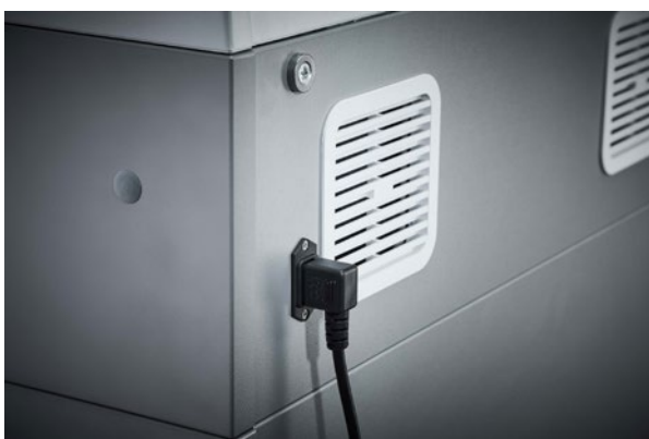
Dahle Office 419 document shredder