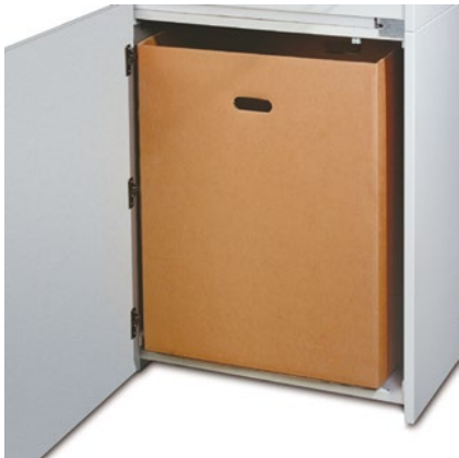
Sturdy waste boxes for permanent use with models 20390 to 20397