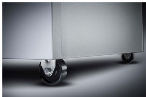
Dahle Office 419 document shredder