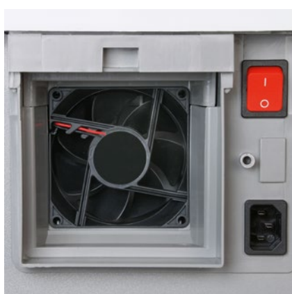
Powerful fan sucks in fine dust particles inside the document shredder and feeds them to the filter