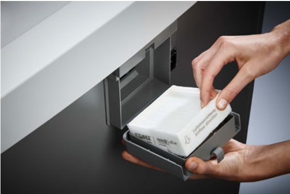
Improved indoor climate even when in heavy use: the unique DAHLE CleanTEC® filter system reduces fine dust pollution from the document shredder