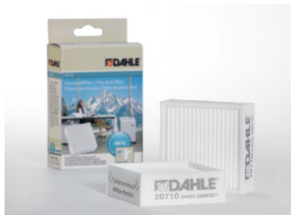
Fine particle filters Dahle 20710