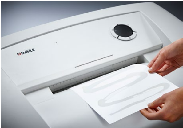
Dahle Waste 214air document shredder