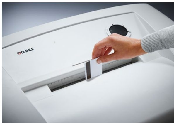
Reliably destroys cards