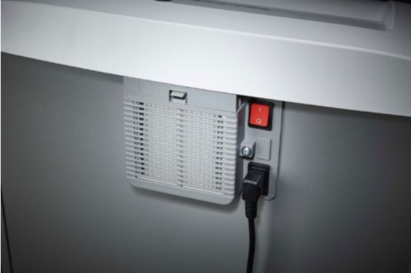
Detachable IEC power plug makes the document shredder quick and easy to move from A to B