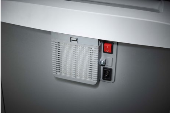
Separate main switch is located on the rear of the document shredder and completely disconnects it from the mains power supply