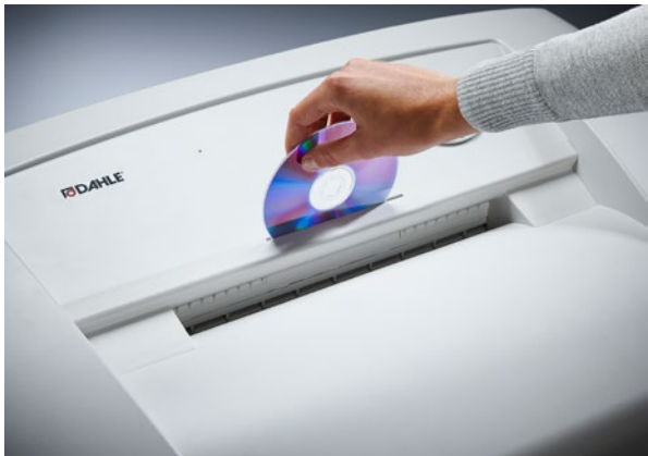
Separate CD feed opening with dedicated collection bin for environmentally friendly waste separation and secure destruction