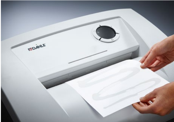
Dahle Waste 106air document shredder