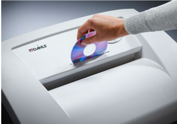
Separate CD feed opening with dedicated collection bin for environmentally friendly waste separation and secure destruction