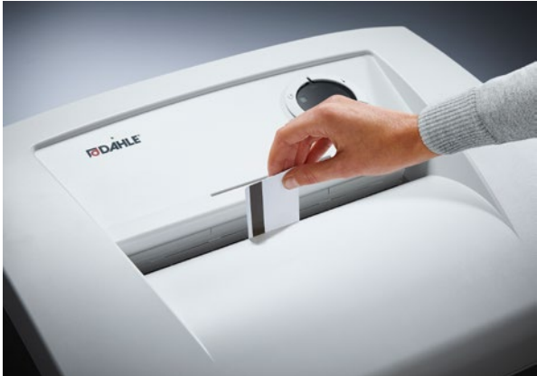
Reliably destroys cards