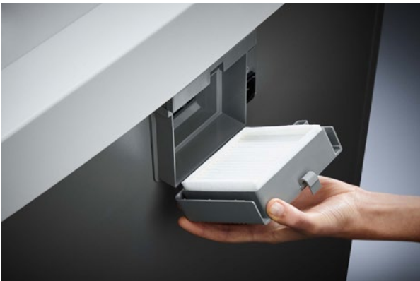
Dahle Waste 106air document shredder